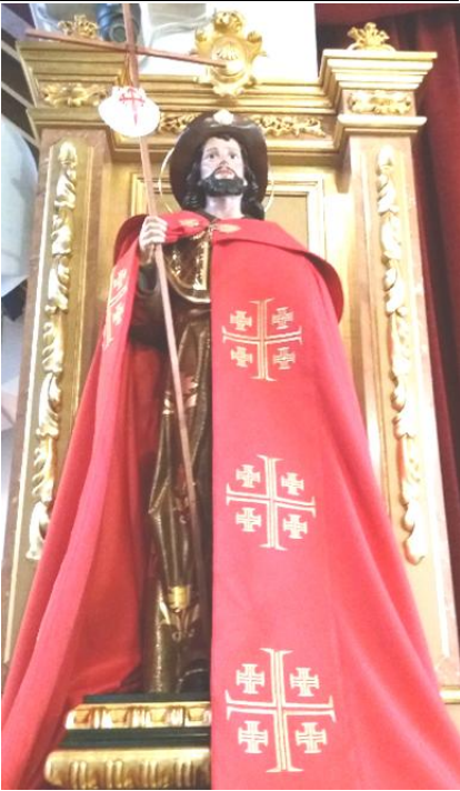
St. James at Blessed Sacrament, Walton Vale, Aintree

Pope Leo XIV's prayer intention for the month of July Pray that we may know how to choose the right path for our life and reject anything that leads us away from Christ. The Pope's original prayer echoes the famous prayer of St. Augustine in the Confessions: "Oh God, let me know myself that I might know You!" "In order to discern, it is necessary to place oneself in truth before God, to enter into oneself, to admit one's own weaknesses, and to ask the Lord for healing. These are the steps to rebirth through an authentic relationship with God. This process is known as discernment and helps Christians discover the path toward God—lived in the actions of every day—that already lies deep within our hearts. Formation in discernment, includes prayer, personal reflection, the study of Scripture and spiritual direction. Cultivating a deep relationship with Jesus is the most important aspect."